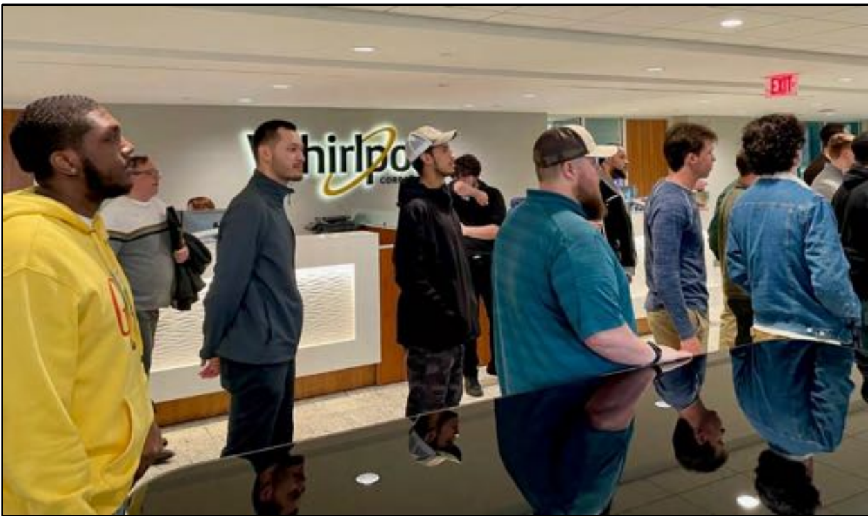
LMC Students touring Whirlpool Global HQ