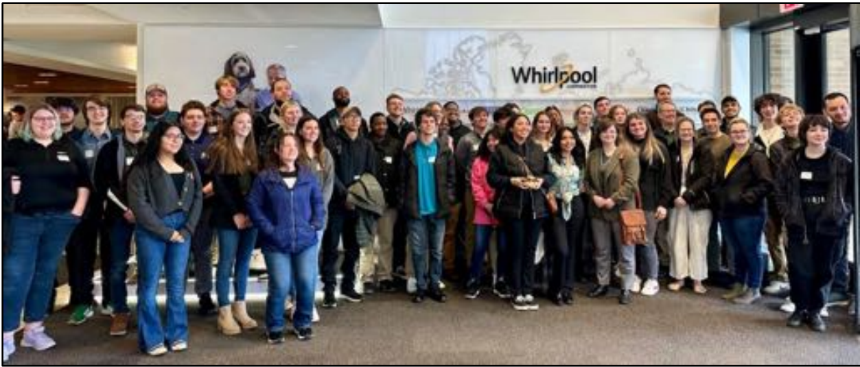
LMC Students at Whirlpool Global HQ