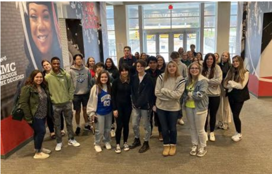
Professional Health Careers Academy (PHCA), and Allied Health students and instructors