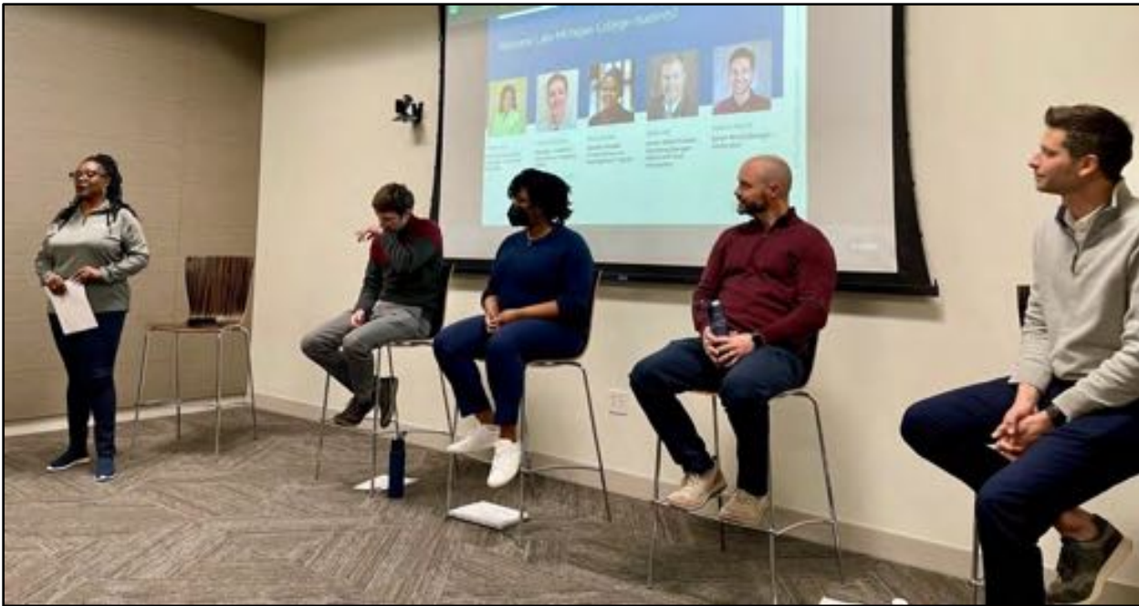
Whirlpool University Relations team welcoming LMC students