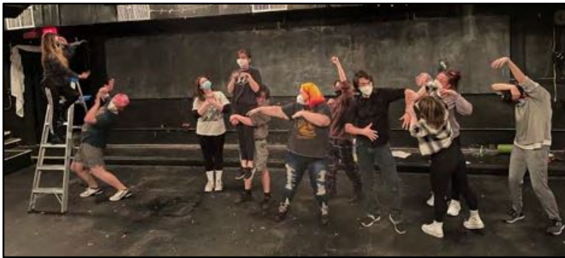
The cast of Working in rehearsal